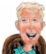
"Oldies Are Now"

Think Local-Shop Local-Advertise Local Serving The Hudson Valley Region Advertise on Internet Radio Rates as low as $1.00 per day